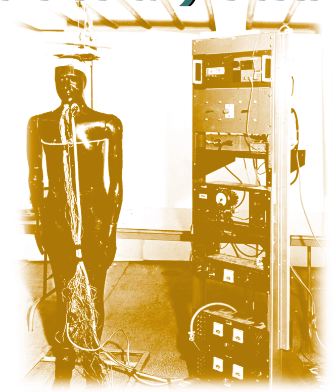
This copper manikin was used in the 1960s to measure the warmth provided by clothing.

Indoor air quality affects both comfort and health. Its effects are often misjudged, because the perception of air quality is strongly influenced by other environmental factors. Temperature and humidity have been found to significantly affect such